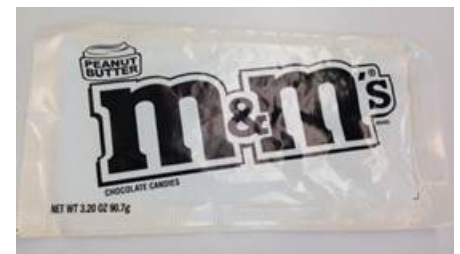
Outside image of box